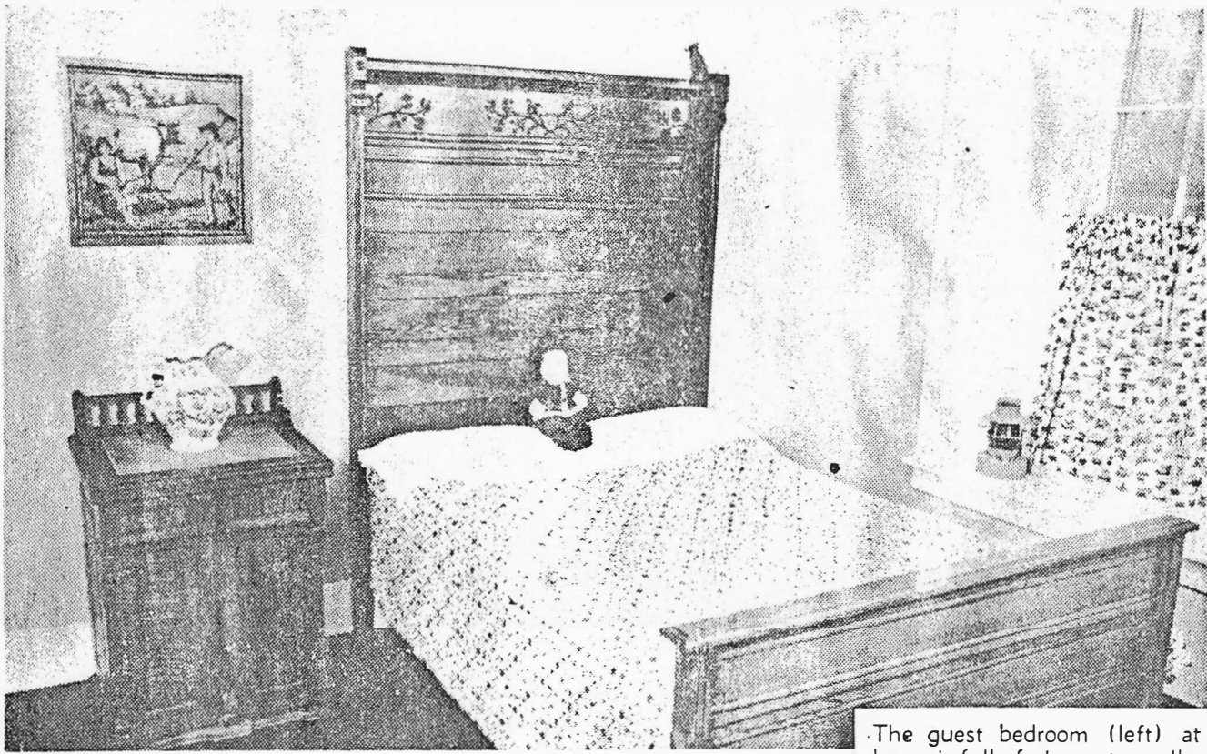
The guest bedroom (left) at the Loerke home is full of pleasant, small surprises such as the commode at the side of the bed which turns into a sewing machine, vintage 1900. The bedroom is done in typical late Victorian period of 1880 to 1900.