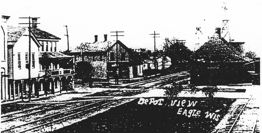
EAGLE'S DEPOT. WINDMILL. WATERTOWER AND STORES. 1908.

The Masonic auditorium would seat 200 people, but when home talent affairs were scheduled, many times standing room at the rear and in the outer entry was filled to capacity. The over flowing crowd gave proof of the jollity people felt on attendance and on recall in years to come.