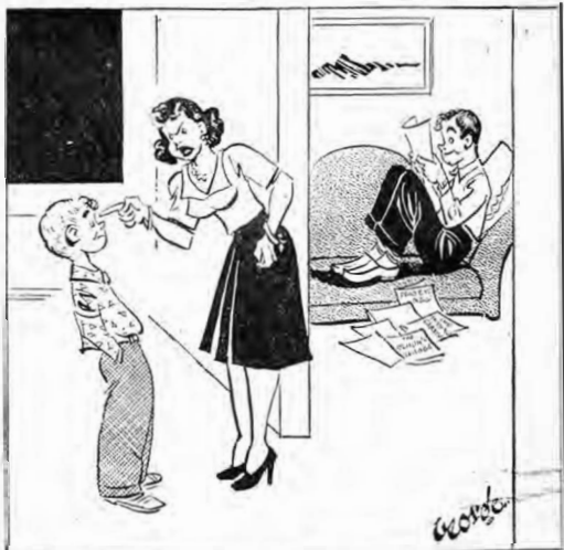
"Why did you have to drag out your comic books to show my boy friend?"

Every year, summer gains in importance as a fashion season. This is probably due to the fact that spring seems to have vanished in some part of the country. At any rate, there seems to be more summer weather and in turn, this means a larger wardrobe. This year, when you shop for summer fashions, you'll find the dress with the little sleeve. But you'll also find the sleeveless dress with the little jacket. Far