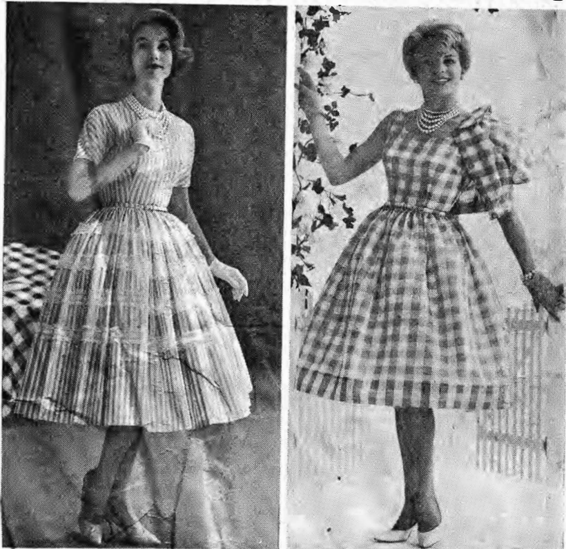
Drip-dry, little-care fabric is used for airy summer dress at left with full skirt. Skirt is circled by bands of white lace and embroidery. Certain to make summer even more pleasant is the little sleeveless dress with its own jacket, right. The cap sleeve has given way to this look in the jacket-dress. Both fashions by Jeanne d'Arc.