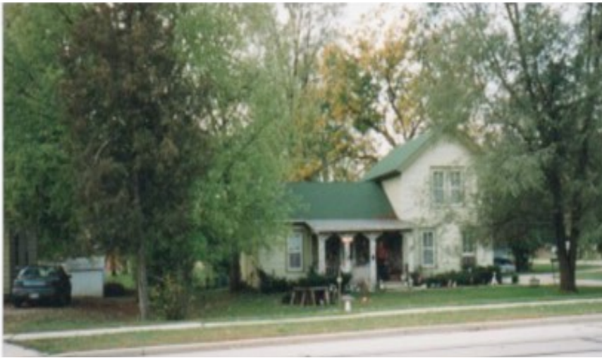
Wambold Home 503 Main Street