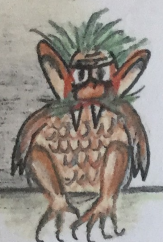
A " SQUISHY " shown actual size

According to an old Potawatomi Indian legend the woods surrounding the trailer park are inhabited by a race of nasty little creatures called "Squishies." They are about the size of a small cherry tomato, have bats wings instead of arms, sharp claws and fangs, long pointed ears, green hair and whiskers and smell like rotten eggs. Fortunately they only make their appearance once in every 175 years and then for just a three day period.